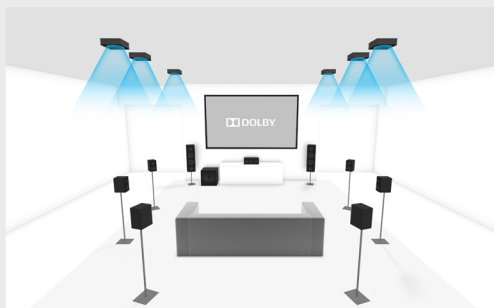
Perspective detail for 9.1.6 setup

This refers to how many overhead or Dolby Atmos enabled speakers you can use in your Dolby Atmos capable setup.